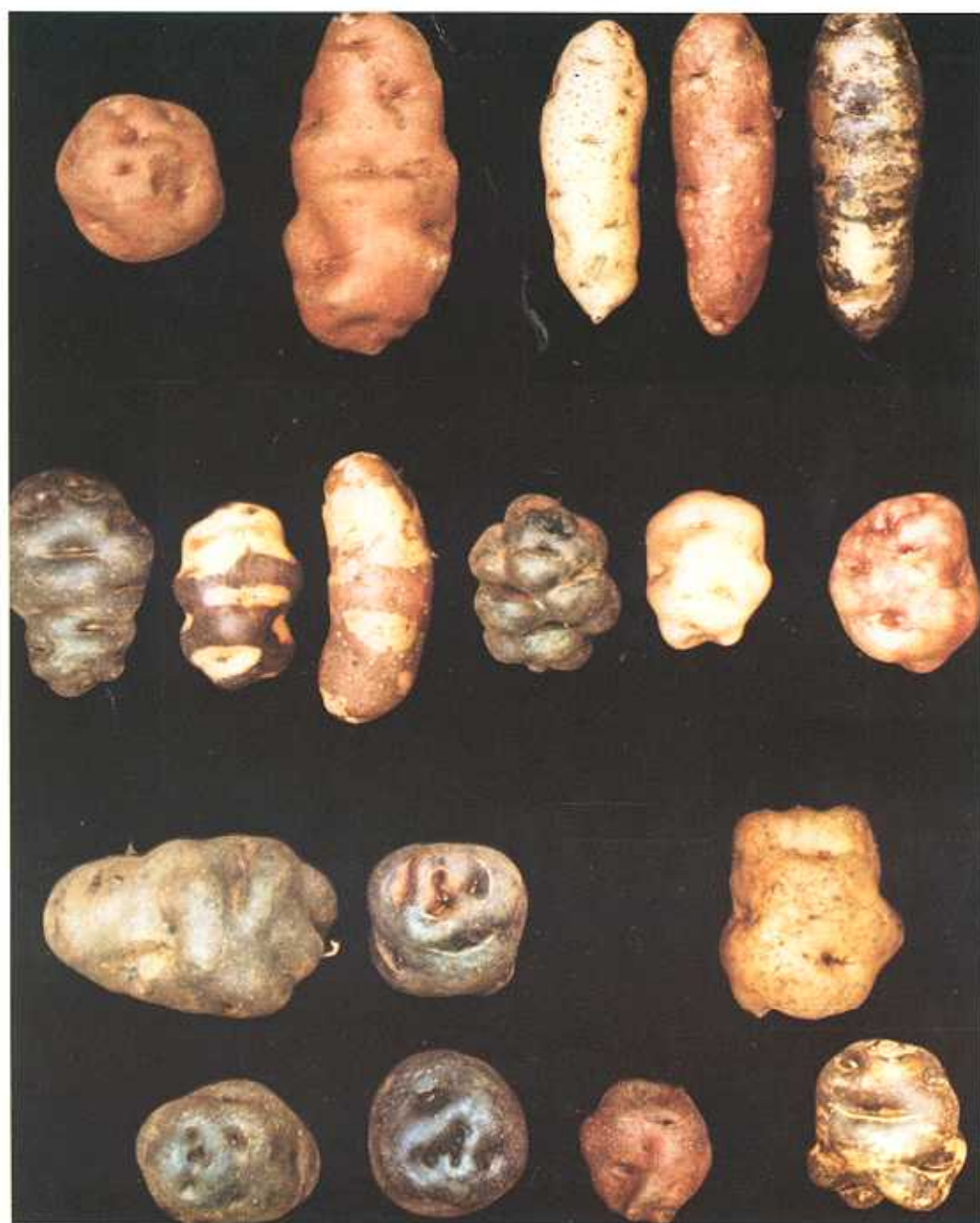
Fig. 1. Morphotypes of S. × chaucha .

L. to R., first row: Duraznillo, Huayro, Garhuash Shuito, Pucá Shuito, Yana Shuito.